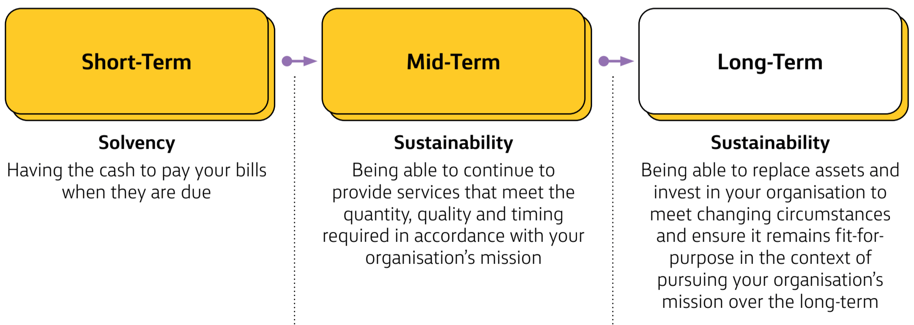
Figure 1: the balance sheet and sustainability

Equity is the difference between the value of all of the assets and liabilities. It can be considered the net wealth or net worth of an organisation. It is this net wealth that is critical in ensuring ongoing sustainability of a not-for-profit organisation over its life. Sustainability is often assessed over three time periods, as described in figure 1 below. Figure 1, Table 1, on page 11, provides a breakdown of the components of the balance sheet and key aspects that are critical to an understanding of this report.