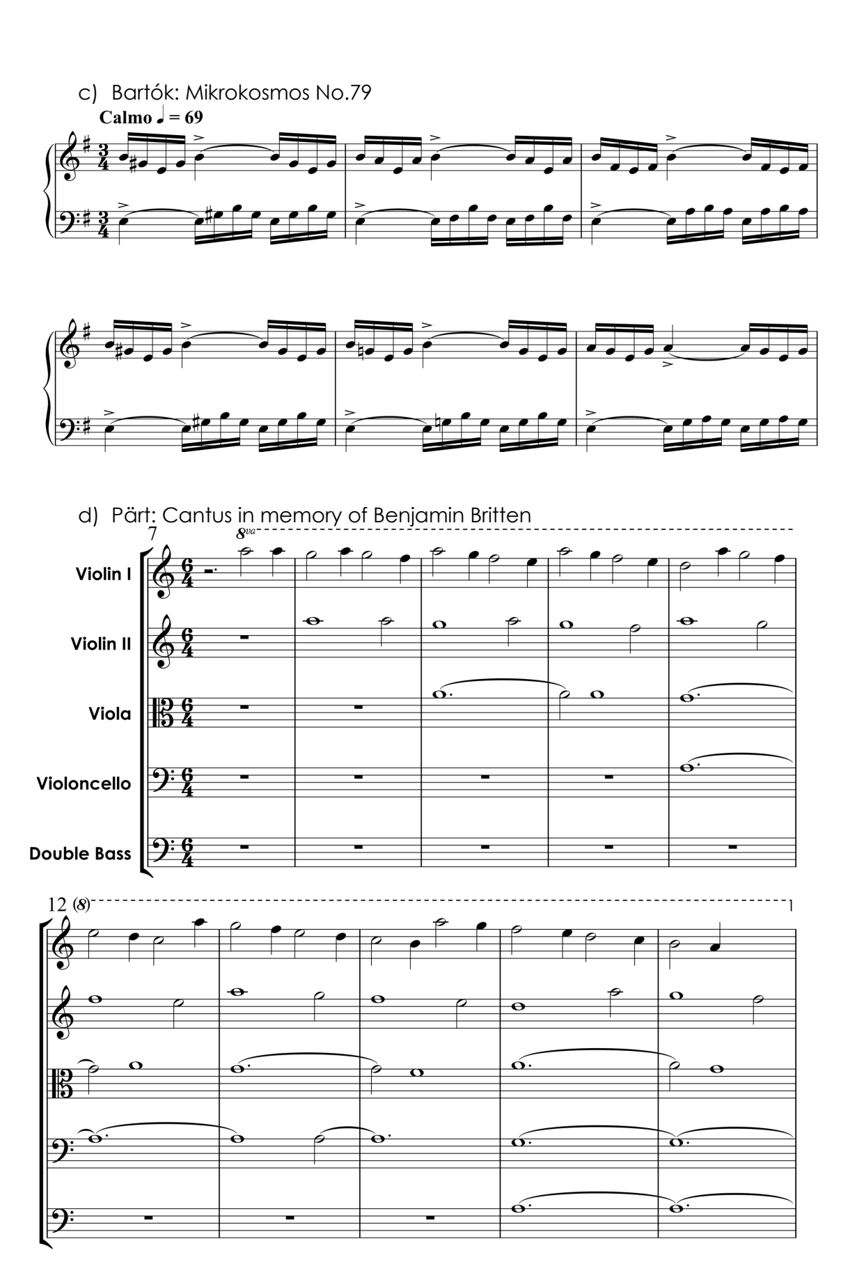
SCROLL TO PAGE 4 FOR ANSWERS